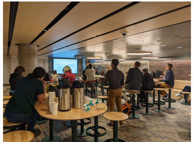
Official launch of the French-translated toolkit at UQAM